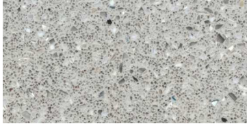
Blend 1 - Ice Grey