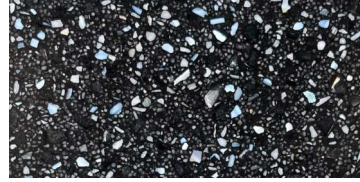
Blend 4 - Onyx Black

Many more colour variations can be achieved with custom aggregate blends and base pigments. Contact your nearest office for more details.