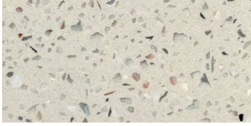
Blend 3 - Perrola